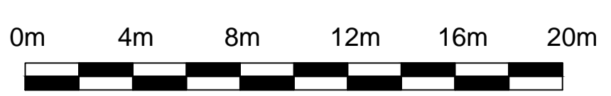
PROPOSED BUILDING BLOCK PLAN @ 1:200