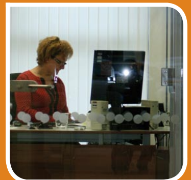
Ameon Interior Office Space